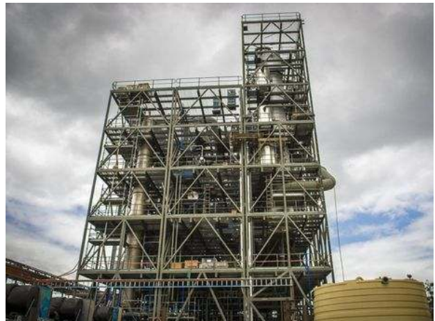
The construction of the oil refinery will create 1800 new jobs.

The construction of the terminal would employ about 180 people.